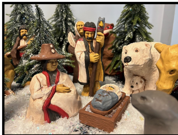
This Creche Scene is from Alaska!

The congregation has been bringing in their favored and unique creches to display during Advent. Many of these are from different cultures, and some hold special meaning. Each creche is identified with a card explaining the significance of it. Be sure to come downstairs during Coffee Hour each Sunday in Advent and take a look at the display.