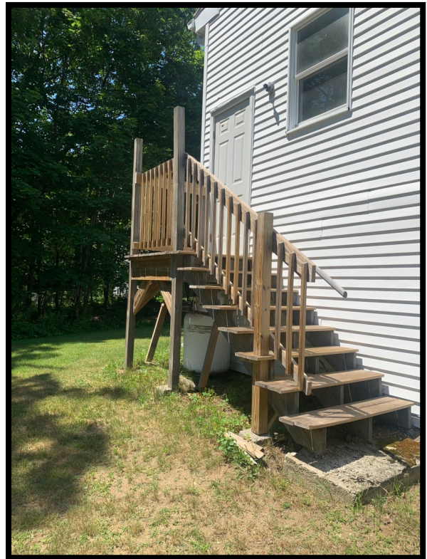
Emergency egress stairs sanded & sealed at last month’s Painting Party