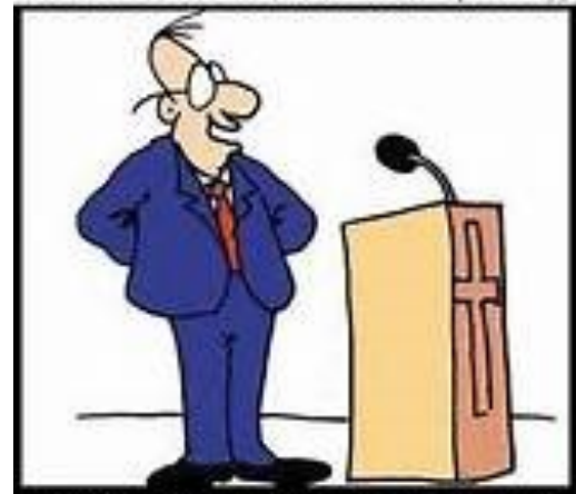
"Now that the Deacons have locked all the doors, my sermon topic today is tithing..."