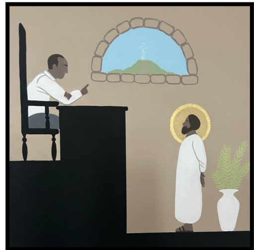
Artwork by E. C. for Station 5, "Jesus is Judged by Pilate", is shown below. If you look closely out the window of this painting you will faintly see a cross at the top of the hill. When you see this artwork in person, the cross is only sometimes visible. Very cool!

Happy Birthday to Jim Colby who turned 80 on Easter Sunday!